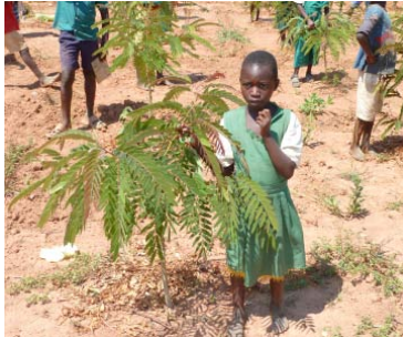
We work with primary schools on tree planting projects and get students involved