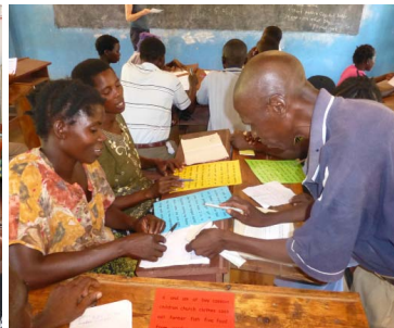
We now support two local adult literacy groups and there is a need to expand this in the future