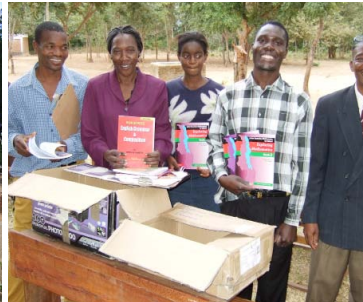
We have provided text books to all classes. Many other schools have very few text books