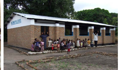
We have built classroom blocks, kitchens and toilets but the local community needs more