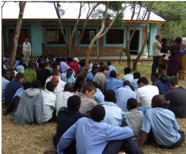
RIPPLE Africa has built Kapanda Community Day Secondary School and provides continued support