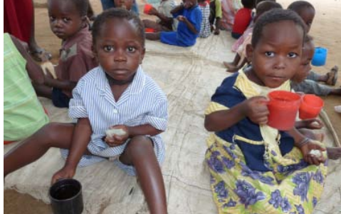
We provide tea and sweet potato meals every day at the pre-schools. Additionally, local wood carvers make educational toys for the children