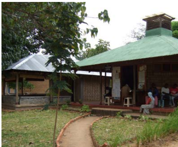
We have built Mwaya Community Library and an adjoining reading room