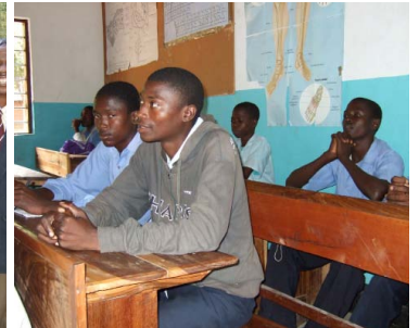
There is a school scholarship scheme based on merit to pay the fees of the selected students