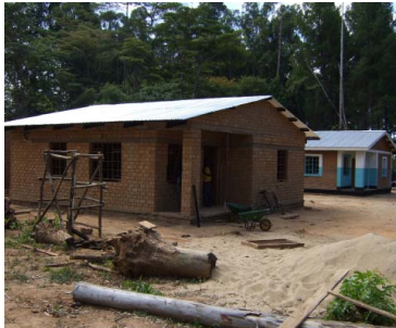
We build teachers' houses to attract and retain good teachers