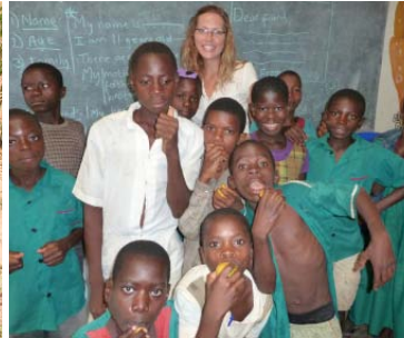
RIPPLE Africa volunteers help at all of the primary schools