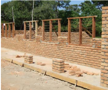
We have built classroom blocks, and we help to maintain school buildings